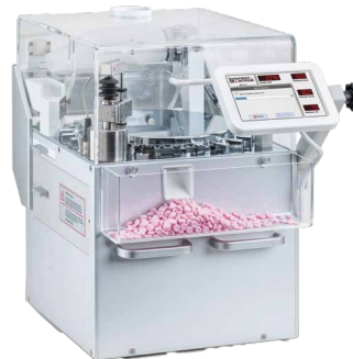
UTS4.1 Automatic Tablet Testing System