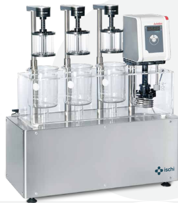
Disintegration Testers Available with 1, 2, 3 or 4 independent test stations