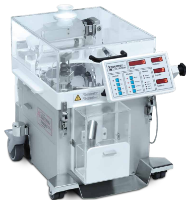
UTS-S20. Dust-proof Tablet Testing System (OEB level 3)