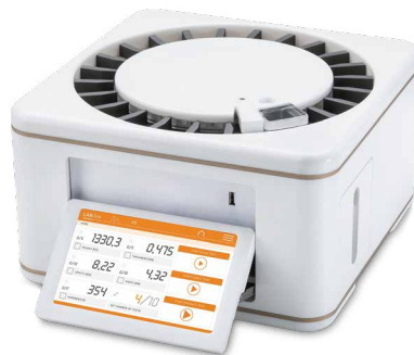
P-Series. Semi-Automatic Tablet Testers P3, P4, P5