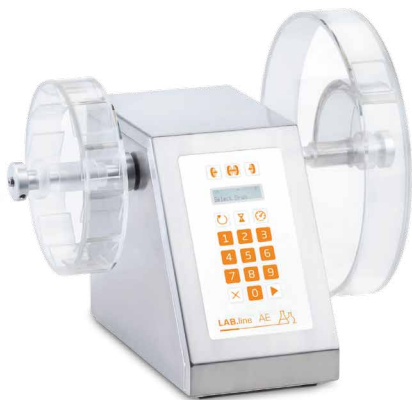
Friability + Abrasion Testers AE-1i with one drum axis AE-2i with two drum axes