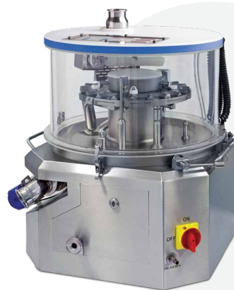
UTS-IP65i. Containment & Wash-in-Place Tablet Testing System (OEB level 5)