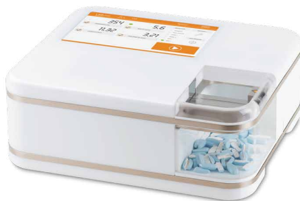
H-Series. Tablet Hardness Testers H2, H3, H4, H5