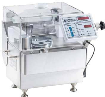
Automatic Weighing System for Tablets & Capsules CIW6.2 / CIW6.3 / CIW6.4